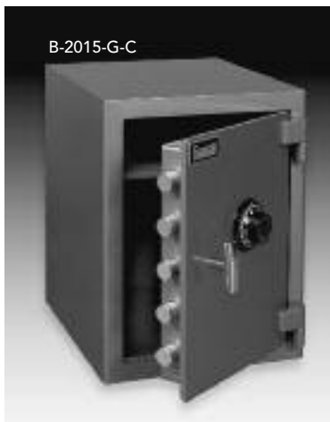
Five massive 1/4" bolts in boltwork