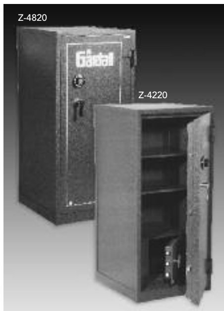
Designed for complete protection of your valuables, a “B” rated burglary safe security welded inside a fire resistive safe.

Visit us online at www.gardall.com MADE IN THE U.S.A.