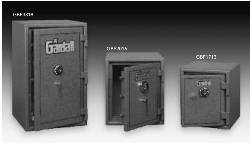
Gardall's GBF models provide both burglary and fire protection for your home or office application. We have been manufacturing fire safes since 1950 and the GBF safe is our premier model in quality and function.

All GBF safes were tested by the manufacturer along side a U.L. listed one-hour fire safe in an independent fire testing facility. The GBF safe actually outperformed the U.L. fire safe by 15 minutes. The exterior of the safe was heated to 1700°F for one hour and during that time the interior temperature of the safe was less than 270°F. A letter of certification is available upon request. All GBF safes carry Gardall's Lifetime Replacement Guarantee.