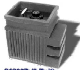
S1200B (5 Bolt) S1201B (Lock Bolt Only)

Our patented "Poly" safe represents the most dramatic design innovation ever for in-floor safes. This safe provides features never before dreamed of, such as; storage shelves, a filing system and a false floor. False floor available on FS4000B model only. When an in-floor safe is what you need, this is the one you want.