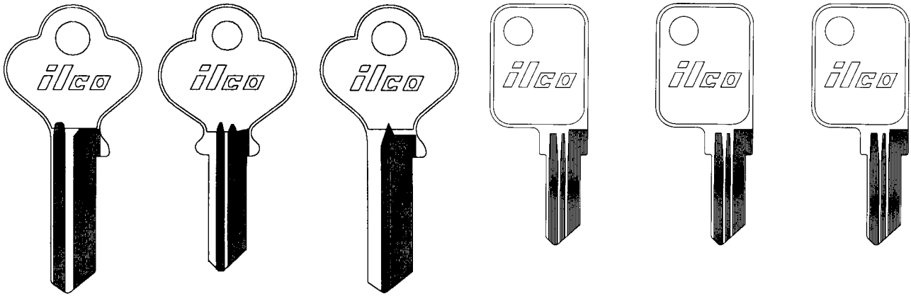
1014C 1, 2